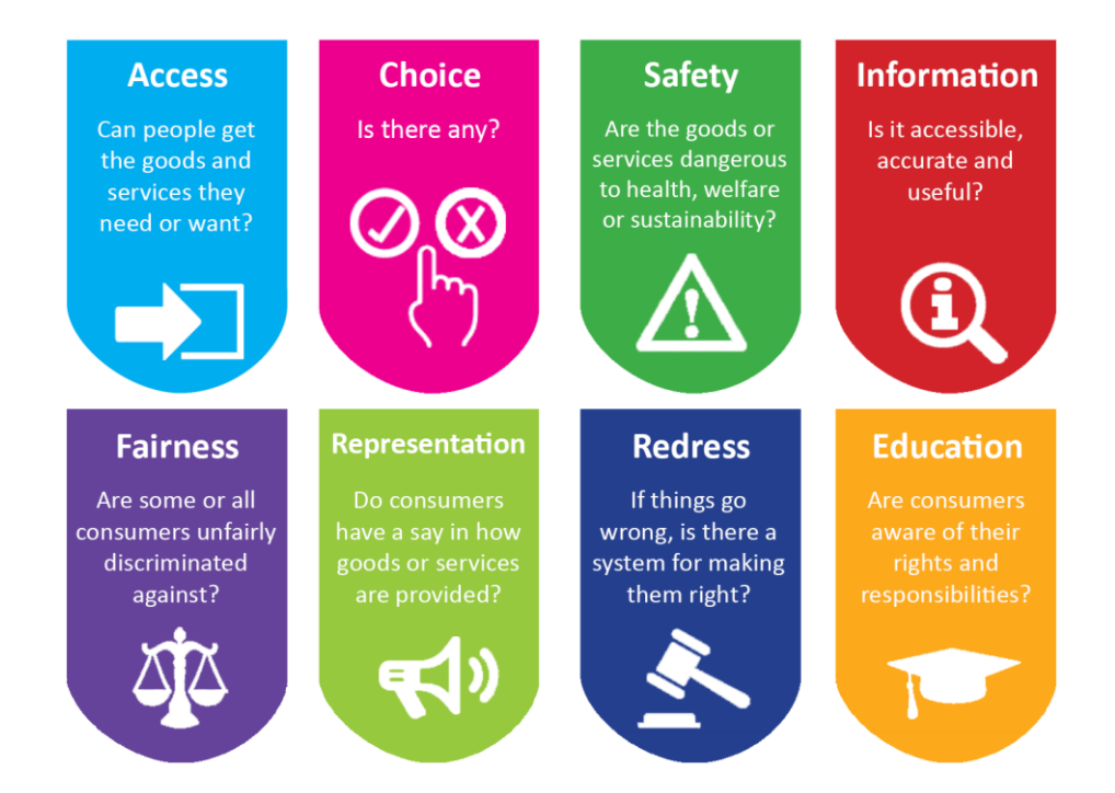
Figure 2: Consumer protection principles

The principles ensure we apply a consistent approach across our statutory and non-statutory functions, and in all our engagement with consumers and stakeholders.